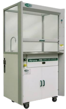
AIRONE 1000RS MOBILE FILTRATION FUME CABINET