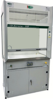
AIRONE X2 DUCTED FUME CUPBOARD