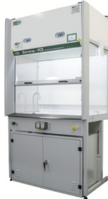
AIRONE R3 FILTRATION FUME CABINET