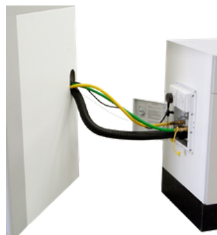
DOCKING STATION FOR AIRONE 1000RS & 1000DS