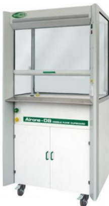
AIRONE 1000DS SEMI-MOBILE DUCTED FUME CUPBOARD