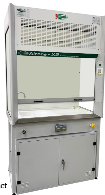
Airone 1200X2 with vented storage cabinet