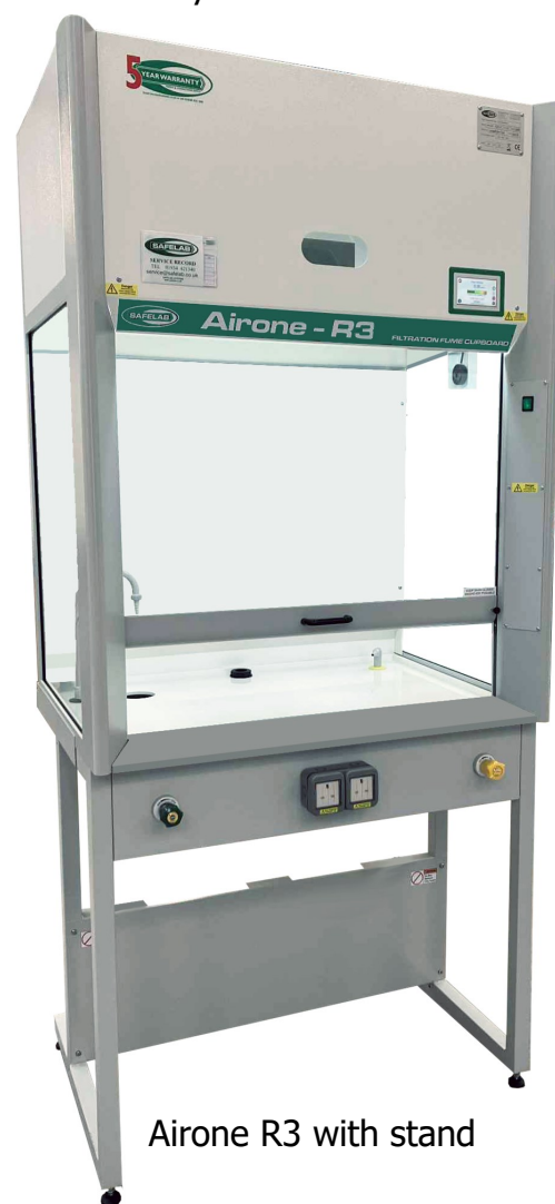
Airone R3 with stand

Each unit incorporates a VAV system which ensures the inflow is constant at variable sash heights. A counterweighted sliding front sash and clear laminated glass sides provide good access and visibility.