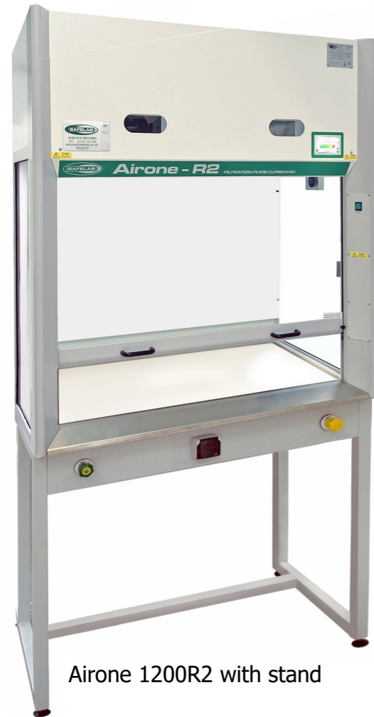
Airone 1200R2 with stand

Each unit incorporates a VAV system which ensures the inflow is constant at variable sash heights. A counterweighted sliding front sash and clear laminated glass sides provide good access and visibility.