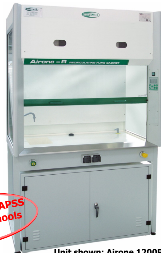
Unit shown: Airone 1200R with optional storage cabinet