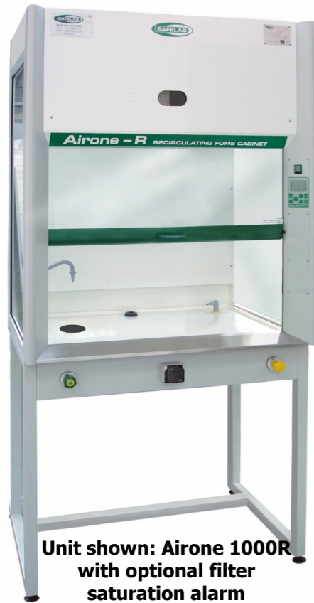
Unit shown: Airone 1000R with optional filter saturation alarm