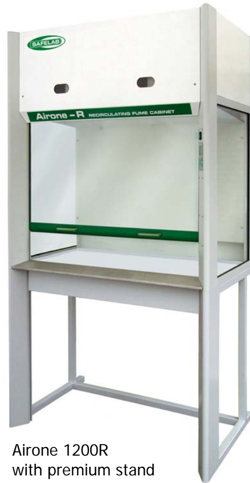
Airone 1200R with premium stand

Each unit incorporates a VAV system which ensures the inflow is constant at variable sash heights. A counterweighted sliding front sash and clear laminated glass sides provide good access and visibility.