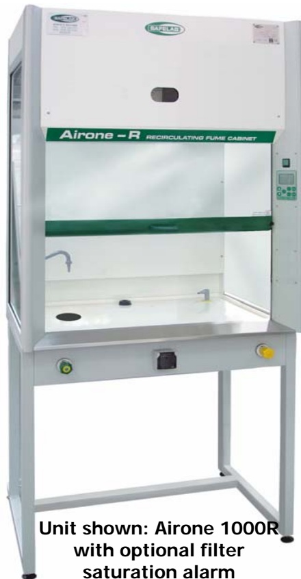
Unit shown: Airone 1000R with optional filter saturation alarm