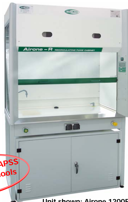
Unit shown: Airone 1200R with optional storage cabinet