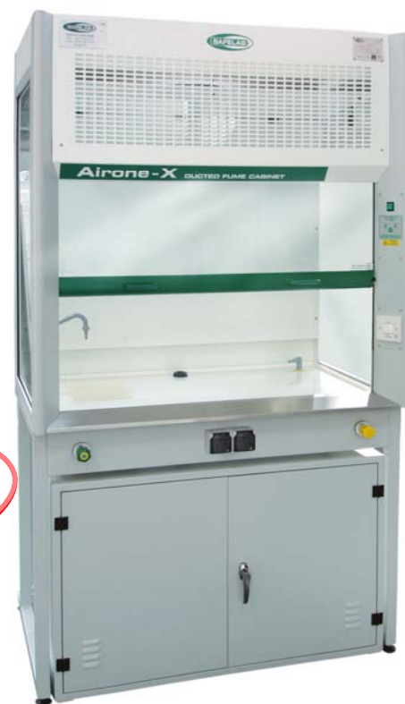
Unit shown: Airone 1200X with optional storage cabinet